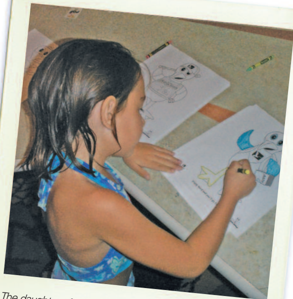
The daughter of a Pewaukee branch customer put her final coloring touches on Seymour Savings at the "Cool Off and Win" contest reception.

A special reception – hosted by North Shore Bank – welcomed the winners and their families to the start of their water adventure. Our thanks to everyone who participated in the bank's summer "Cool Off and Win" Contest. ■